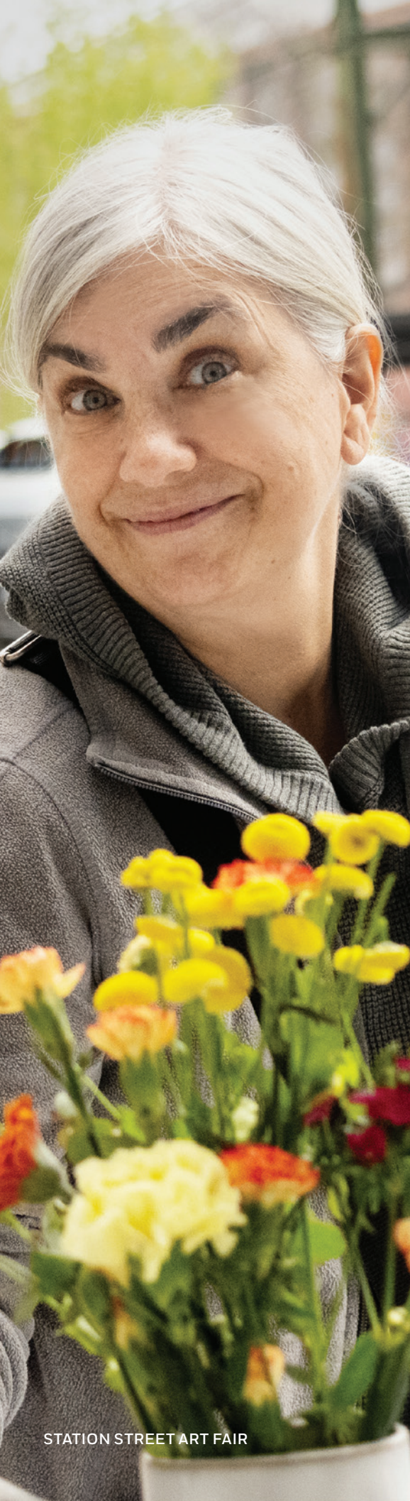
STATION STREET ART FAIR

Working collaboratively with partners and community members across Brookline, we learned where you saw opportunities to invest the $43M in American Rescue Plan Act (ARPA) funding for a more equitable recovery here in Brookline. Thank you to the entire community for your support and for sharing your ideas and insights with us through this process.