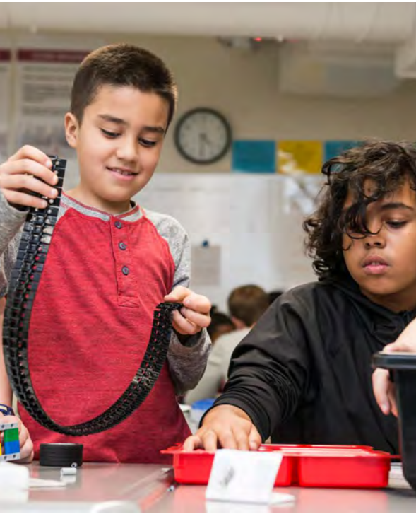
Steps to Success