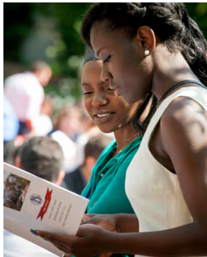
Young women reviewing award recipients at the annual Brookline High School Scholarship Breakfast.